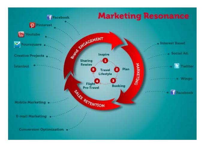
Fig.1 Plan of marketing resonance as an example of airline's strategy

Airline companies are creative in their marketing strategies, for example they use media, loyalty programs, nontraditional advertising methods etc. but it's not always used in the proper way. So that is something that companies should pay attention on. Examples of marketing strategies that can be used are listed below.