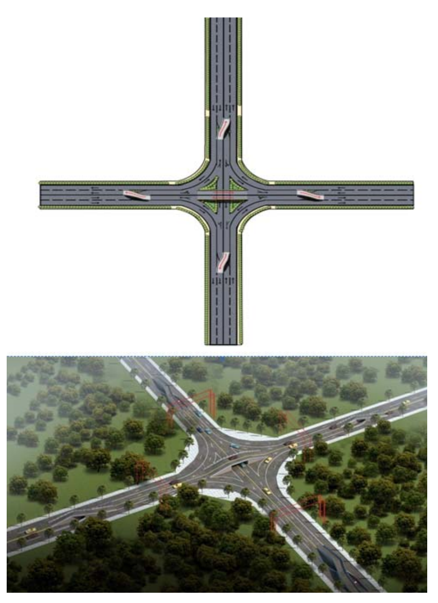
Fig. 2. CAD map after traffic distribution at the crossroads