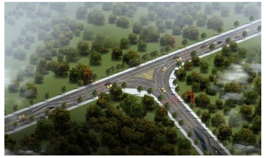
Fig. 3. The CAD map after the distribution of the T-junction traffic

The T-shaped traffic junction is simpler than the cross-shaped junction. In addition, that does not require passage through the central transport interchange, the trajectory of the course of each entrance turnbuckle is absolutely the same as for a cross-shaped traffic intersection.