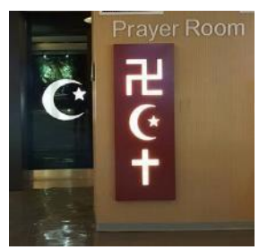
Figure 12. Prayer room in Taoyuan Airport. https://www.google.com/imgres?imgurl