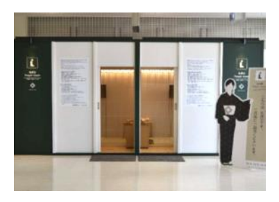
Figure 17. Naha airport. https://www.naha-airport.co.jp/en/terminal/international/