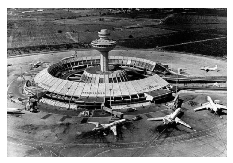
Figure 1. Yerevan Zvartnots International Airport Terminal. https://novostimira.com/novosti_mira_42546.html