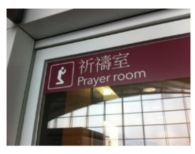
Figure 16. Hokkaido New Chitose Airport. http://prcand.me/posts/2011/12/19/prayerroom-hk-airport.html