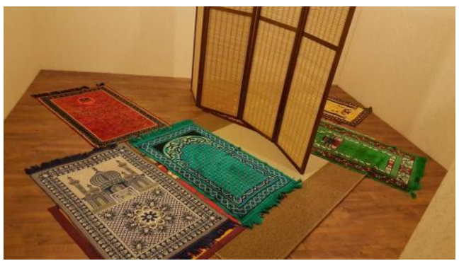
Figure 8. Prayer room in Taoyuan Airport. https://www.google.com/imgres?imgurl=https://lookaside.fbsbx.com/lookaside/crawler/media

Frankfurt Airport also allocates separate areas for Muslims, Christians and Jews, which are equipped with a symbol of the relevant religious affiliation (Figures 9-10).