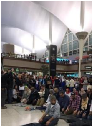
Figure 6. Detroit International Airport. Prayer in the waiting room.