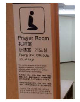
Figure 14. New Chitose Airport.