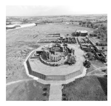
Figure 3. Zvartnots Temple. Aerial photography.