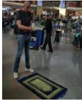
Figure 7. Detroit International Airport. Personal prayer in the waiting room. https://alkhaleejonline.net/