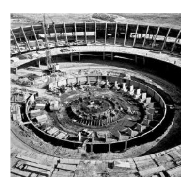
Figure 4. Zvartnots Airport in Yerevan. Foundations, structures of external radius. Photo of the late 1970s.