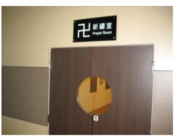
Figure 13. prayer room in Taoyuan Airport.