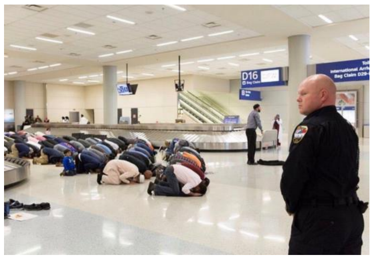
Figure 5. Detroit International Airport. Prayer in the baggage claim hall.

Muslims stranded at Detroit airport prayed in the corridors to protest the decision, saying a large number of non-Muslim travellers took part in the protest, thus supporting the protesters [15]. The protest was really great because it was done peacefully. The position of everyone around the prayers was one of the most exciting scenes because they all felt like they were on the right side.