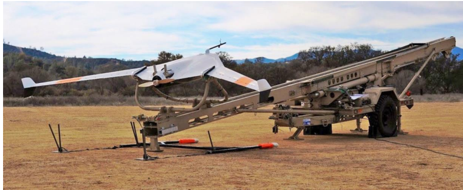
Figure 4. UAV Lockheed Martin starting device, Source https://progress.online/oborona/871-lockheed-martin-narashchivaet-vynoslivost-razvedyvatelnyh-bespilotnikov

SD ergonomic quality indicators are given in table 16.