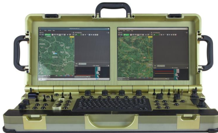
Figure 2. Portable GCS, Source http://www.kvand-is.com/produktsiya/portativnaya-stantsiya-kontrolya-i-upravleniya

GCS ergonomic quality indicators are given in table 9.