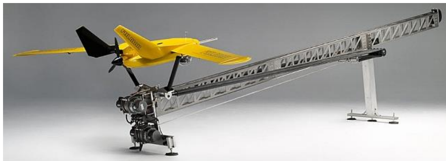
Figure 3. UAV Fulma starting device

Let's define ergodesign quality indicators of starting devices (SD) (see Figures 3, 4). The SD as an object of ergodesign research is, of course, a purely technical structure, where technical parameters are the most important. But ergonomic and operational issues are also important for this object. Let us consider them in tables 2.16 - 2.22