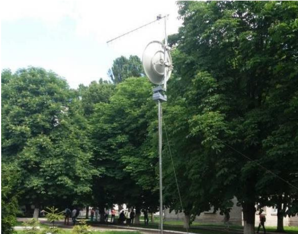
Figure 6. General view of the antenna and rotary device of the UAV M-6-3 "Zhayvir" ground control station (SPCUV "Virazh", NAU)

ARD ergonomic quality indicators are given in table 30.