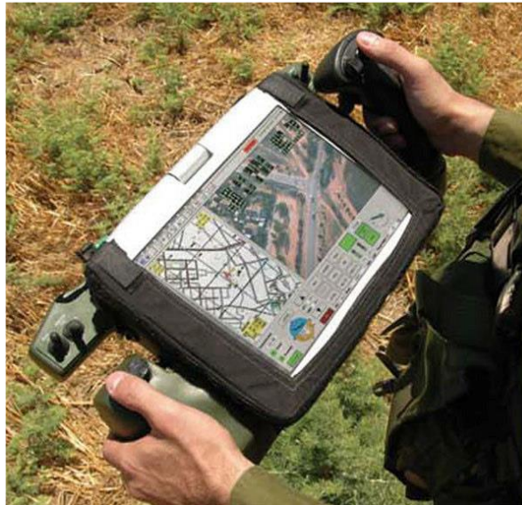
Figure 1. Manual UAV GCS