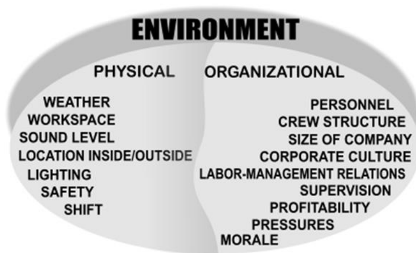
Figure 2. The environment in which they work.

The environment (Figure 2) in the PEAR model is assessed from a physical and organizational point of view [18].