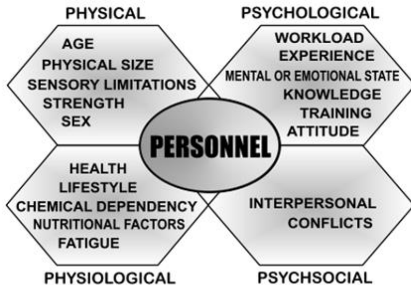
Figure 1. Personnel doing their job.

Figure 1 shows the features that must be taken into account when evaluating personnel [18].