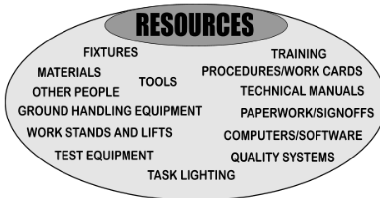
Figure 4. Resources required to get the job done.

The actions of the personnel are carefully analyzed to comply with safety standards when performing work. It is also expected to conduct appropriate training, material, technical and methodological support at workplaces [18].